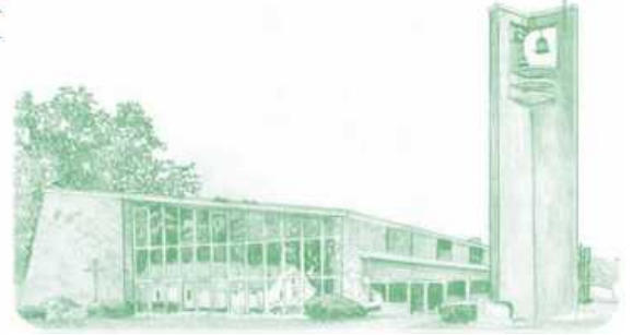
St. James Church Site 2532 Burton St SE Warren, Ohio 44484

September 26, 2021 Twenty Sixth Sunday in Ordinary Time