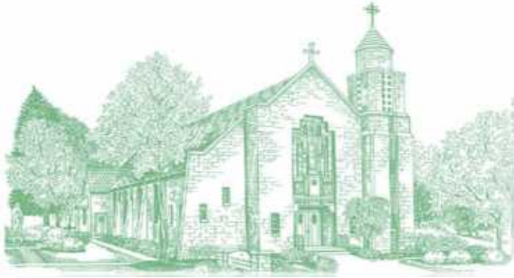
Sts. Cyril & Methodius Church Site 185 Laird Ave. NE Warren, Ohio 44483